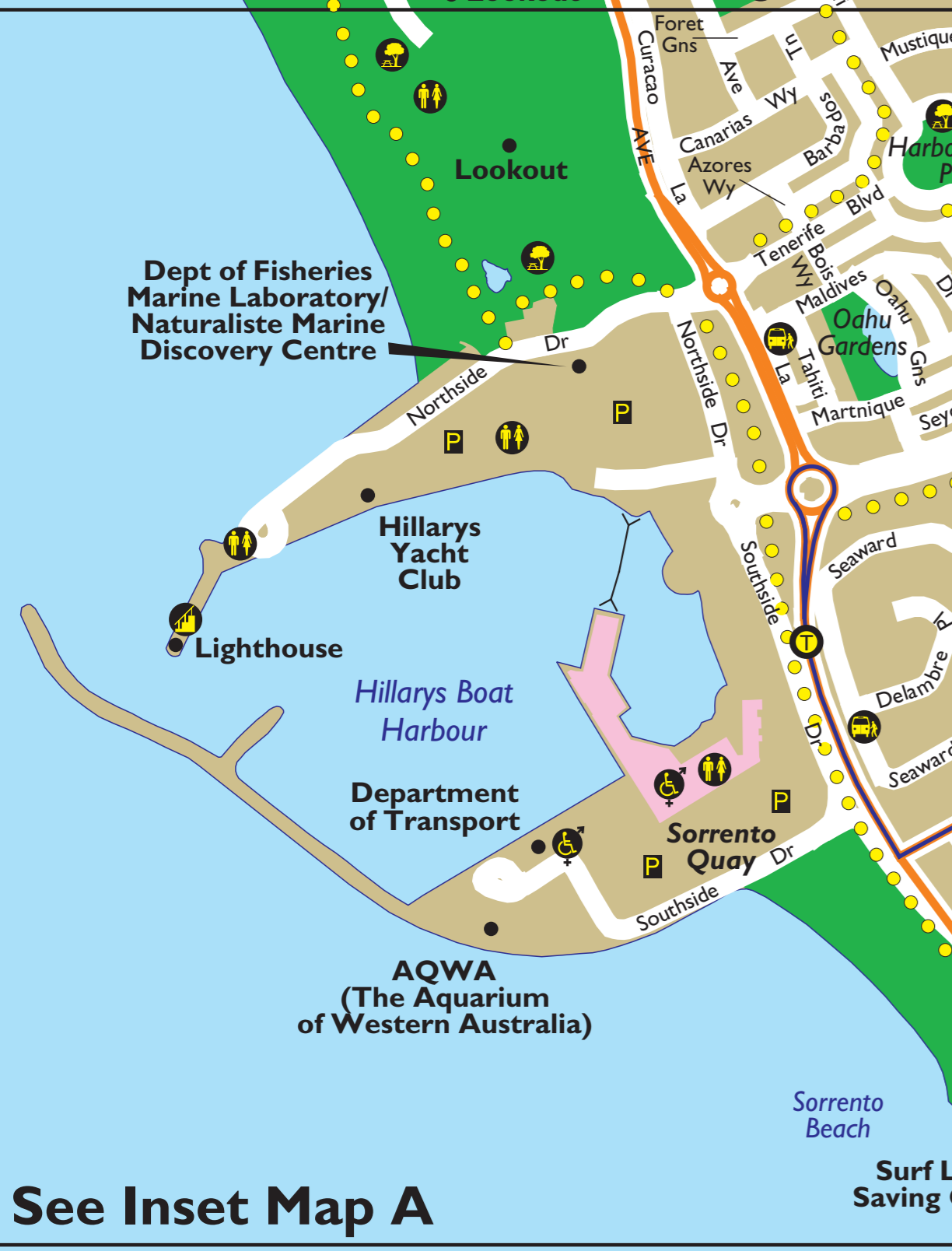
See Inset Map A