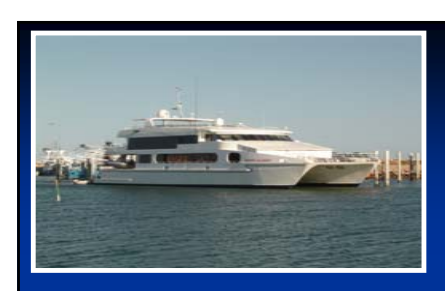
Maxi-sized cruising vessels