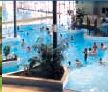
Oasis Recreational Centre

DISTANCE FROM CENTENNIAL PARK: 2.4 km along Gribble Creek cycleway. Access also available via Johnston Street. ATTRICTIONS: Recreational centre includes: Olympic sized indoor heated pool, separate toddlers pool, spa, sauna, stadium, fitness centre, aerobic, crèche, cafeteria, external netball courts and ovals. FACILITIES: Shade, family BBQ grassed area, rubbish bins, seats, toilets, bicycle parking facilities, children's playground equipment and drinking fountains. SUITABLE: for cycling around centre. For further information: contact Oasis on (08) 9022 2922