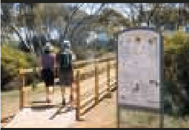
Karlkurla Bushland Park

DISTANCE FROM CENTENNIAL PARK: 3.4 km via Gribble Creek pathway to Burt Street, then 1.3 km along Burt Street (path proposed). ATTRICTIONS: Loopline historical tour departs from the Park and travels to the Super Pit Lookout and Chaffers Power Station. The era is from the 1890's when the railway was one of WA's busiest and best. FACILITIES: Shade, rubbish bins, seats, toilets, rotunda, playground equipment, carpark, bicycle parking and BBQ facilities. NOT SUITABLE: for cycling within park. Bicycle parking being provided. For further information: contact Loopline Railways on (08) 9093 3055