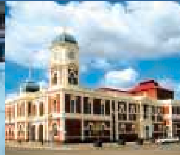
Boulder Town Hall

DISTANCE FROM CENTENNIAL PARK: 3.4 km via Gribble Creek pathway to Burt Street, then 0.8 km along Burt Street (path proposed). ATTRICTIONS: Beautiful historic building opened in 1908. The Goatcher curtain is the last remaining Phillip Goatcher drop curtain. FACILITIES: Shade, rubbish bins, seats and telephone. For further information: contact Boulder Town Hall on (08) 9021 1966