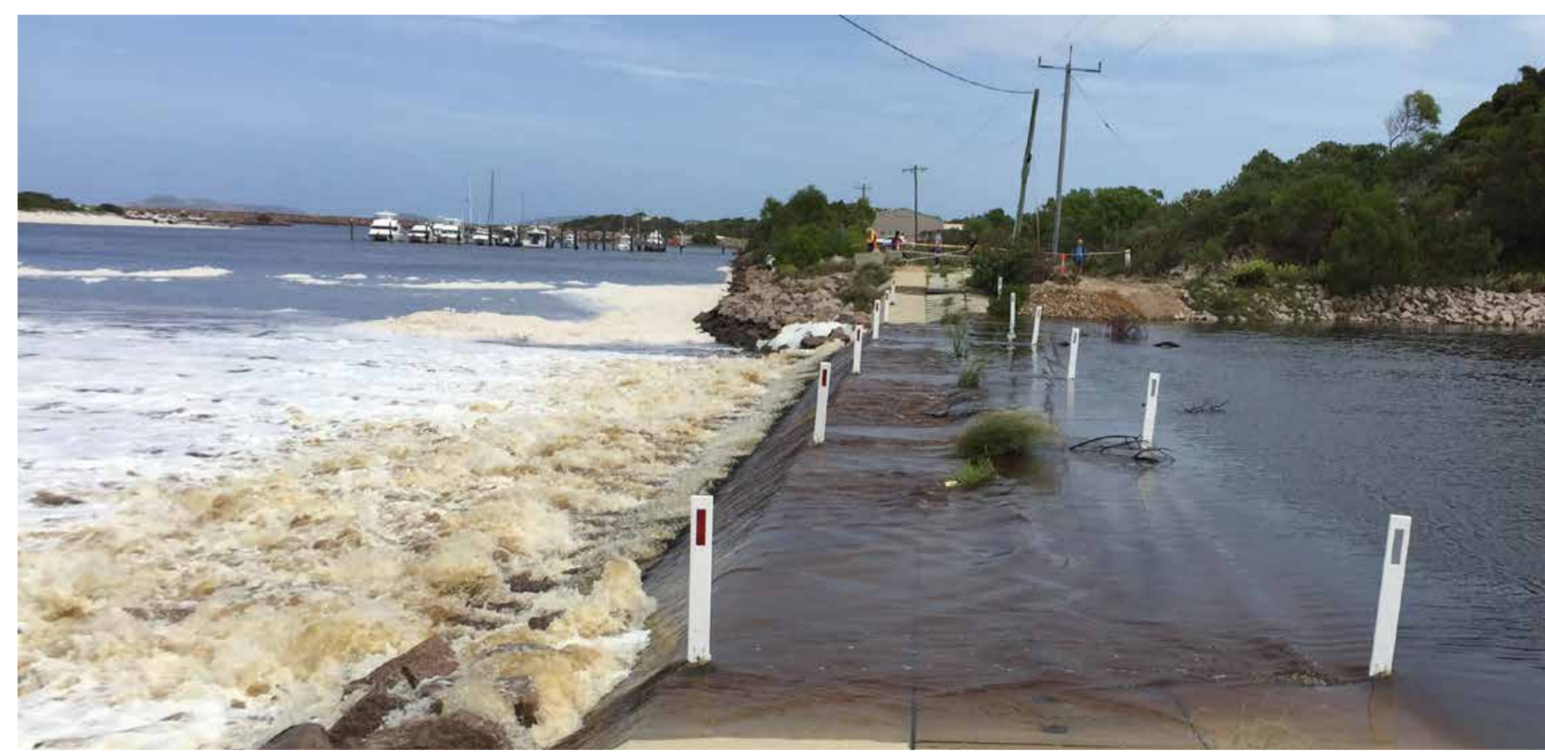
Bandy Creek Weir overtopping