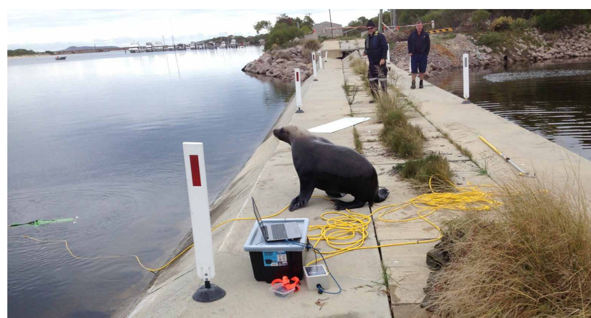
Local resident "Sammy" the seal checking out the underwater survey

The extent of erosion was large and engineers recommended removal and reconstruction of the structure.