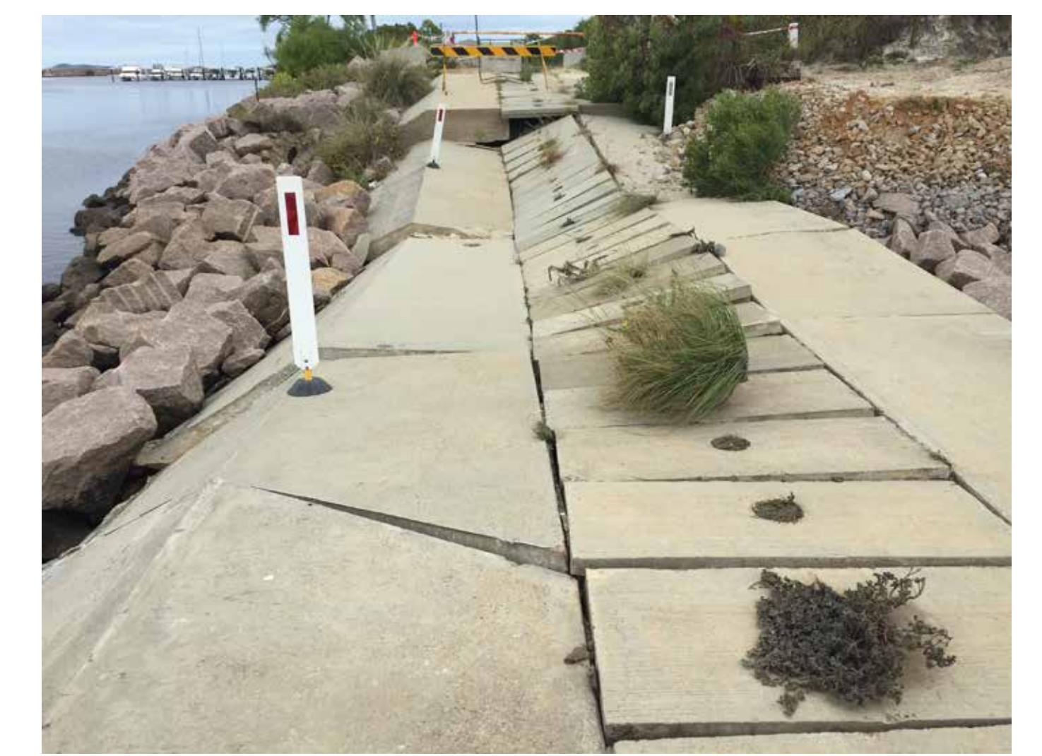
Concrete weir damaged