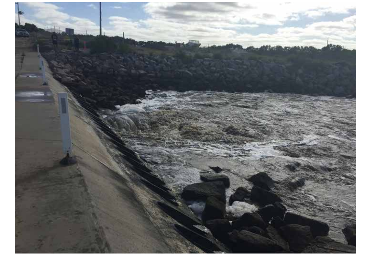
Turbulent flow downstream