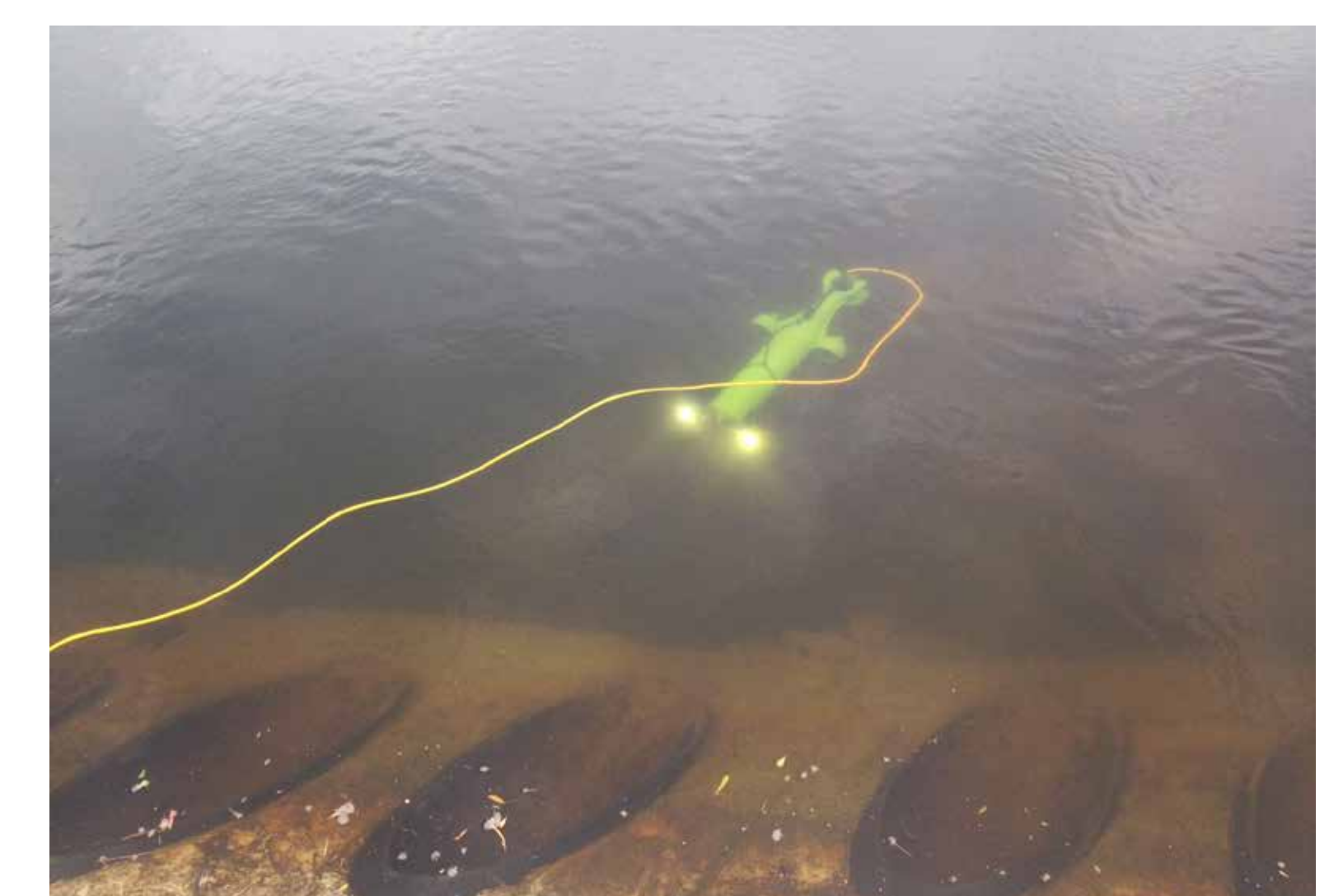
Remote operated vessel (ROV)