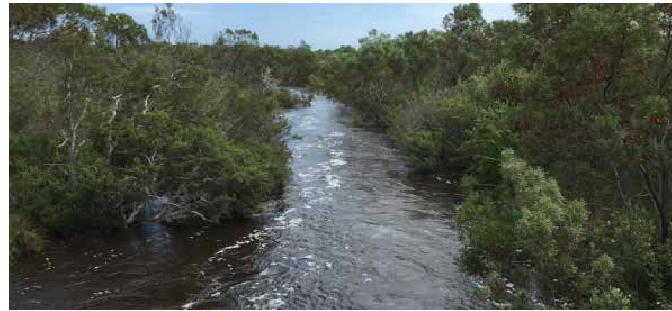
Bandy Creek flooding