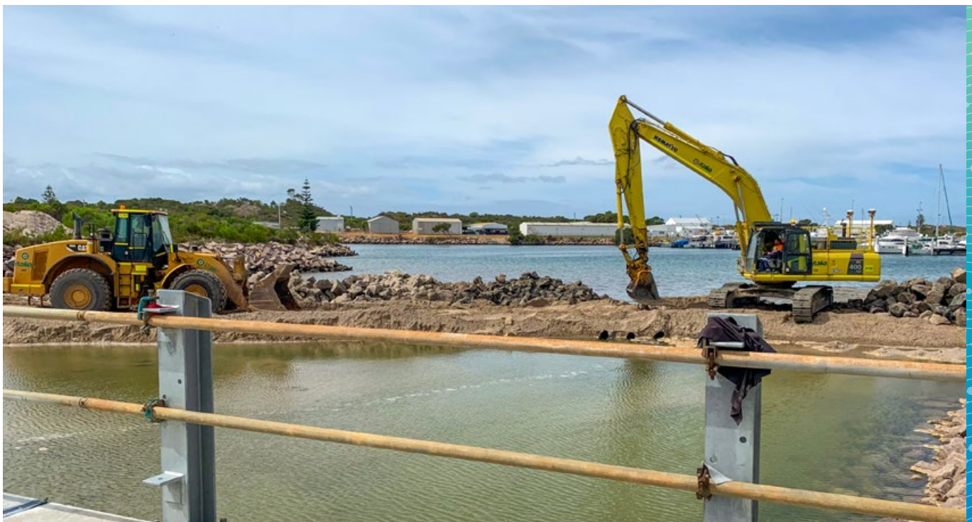
Image: Excavation works at Bandy Creek Weir reconstruction

An example of a consolidated PPI is on the next page.