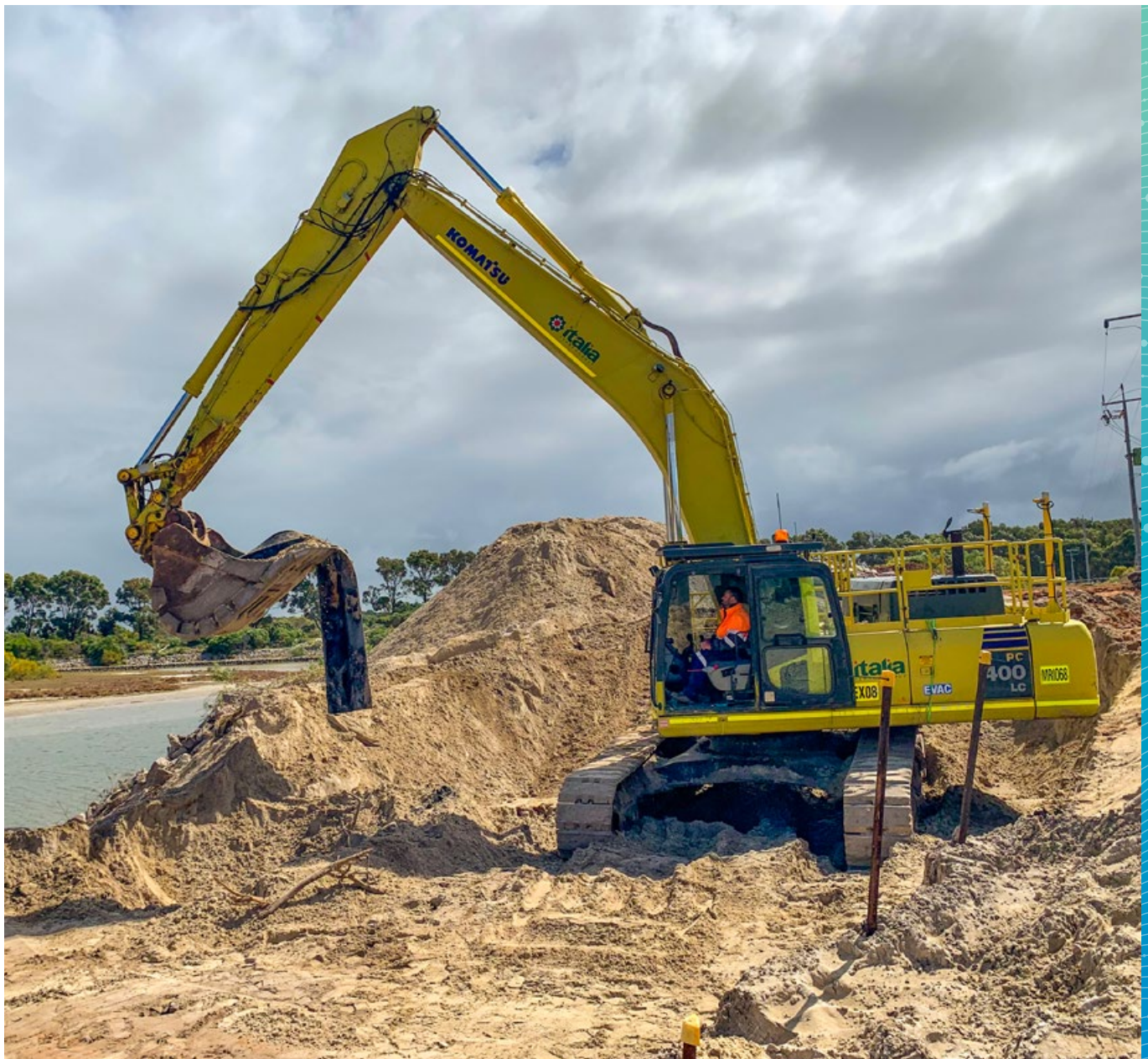
Image: Excavation works at Bandy Creek Weir reconstruction