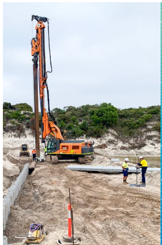
Image: Sheet piling Bandy Creek Weir reconstruction.

Payment from the Department will go into the general PBA sub-account and the entire amount will flow out of the sub-account around half an hour later.