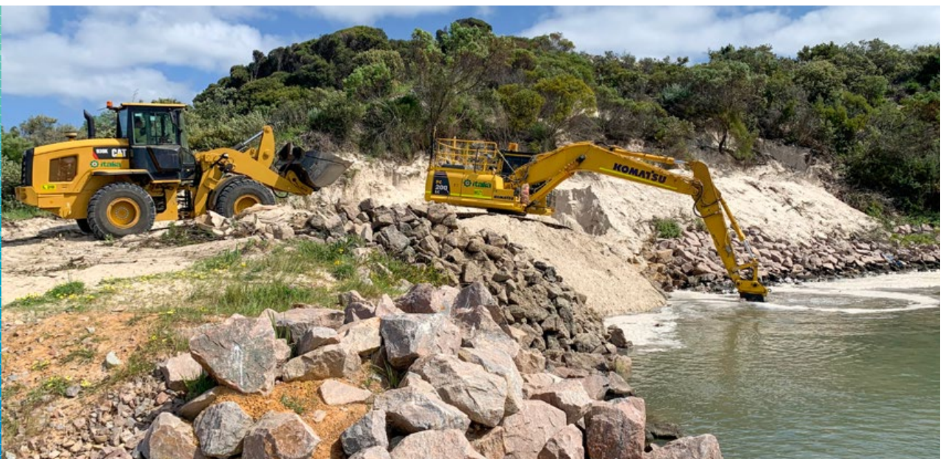
Image: Excavation works at Bandy Creek Weir reconstruction