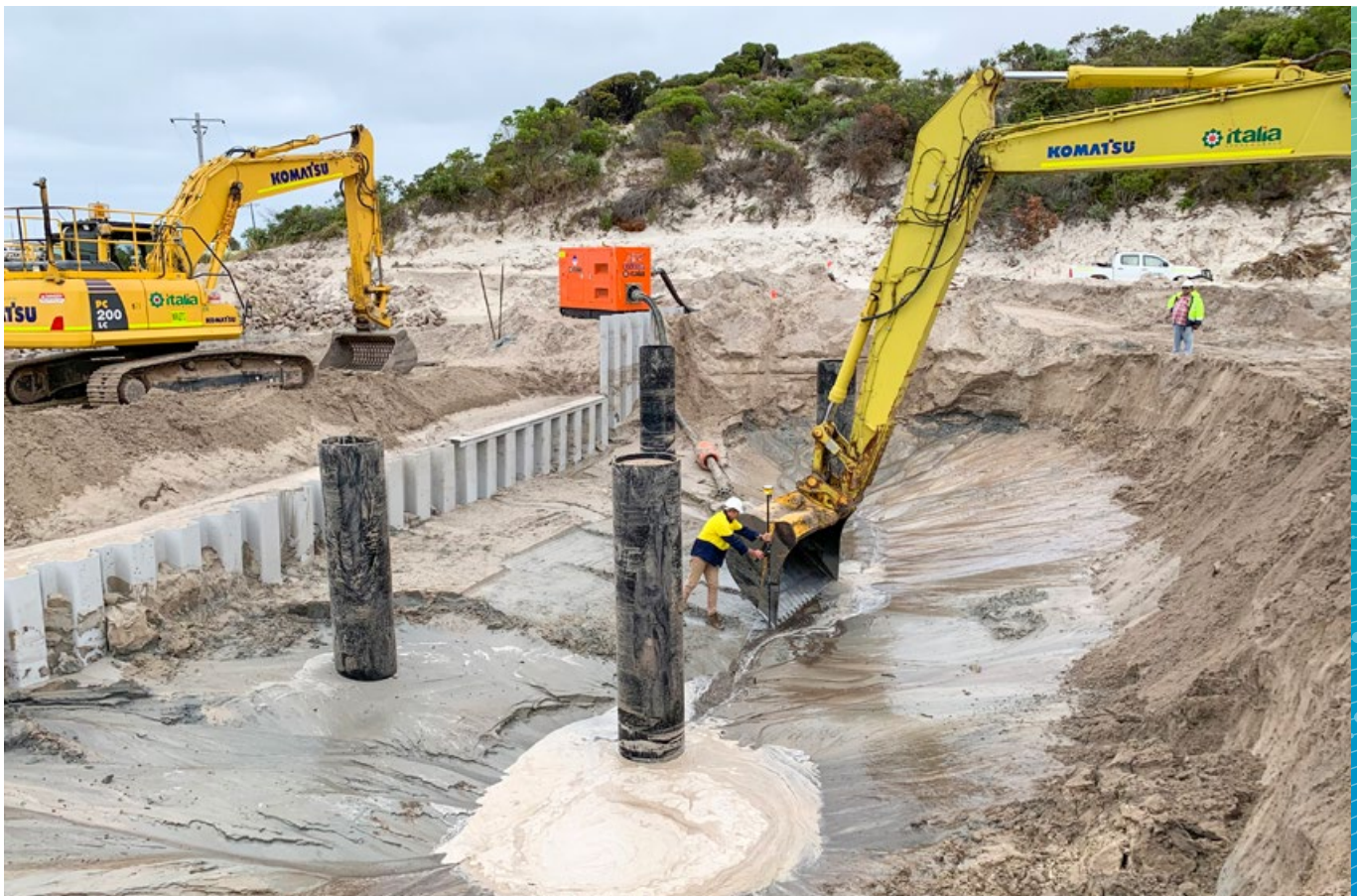
Image: Excavation works at Bandy Creek Weir reconstruction

* payment is from the Retention PBA sub-account directly to the Subcontractor's account, without going through the General PBA sub-account).