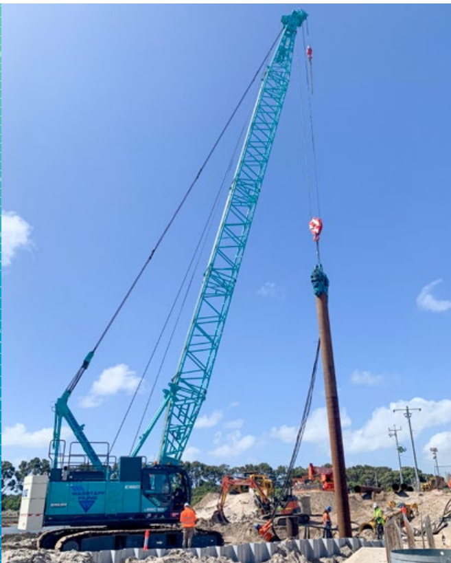
Image: Tubular piling Bandy Creek Weir reconstruction

Please contact the Contracts Officer nominated on the front page of the tender document. We'd prefer you contact us with any questions, so you can get it right the first time.