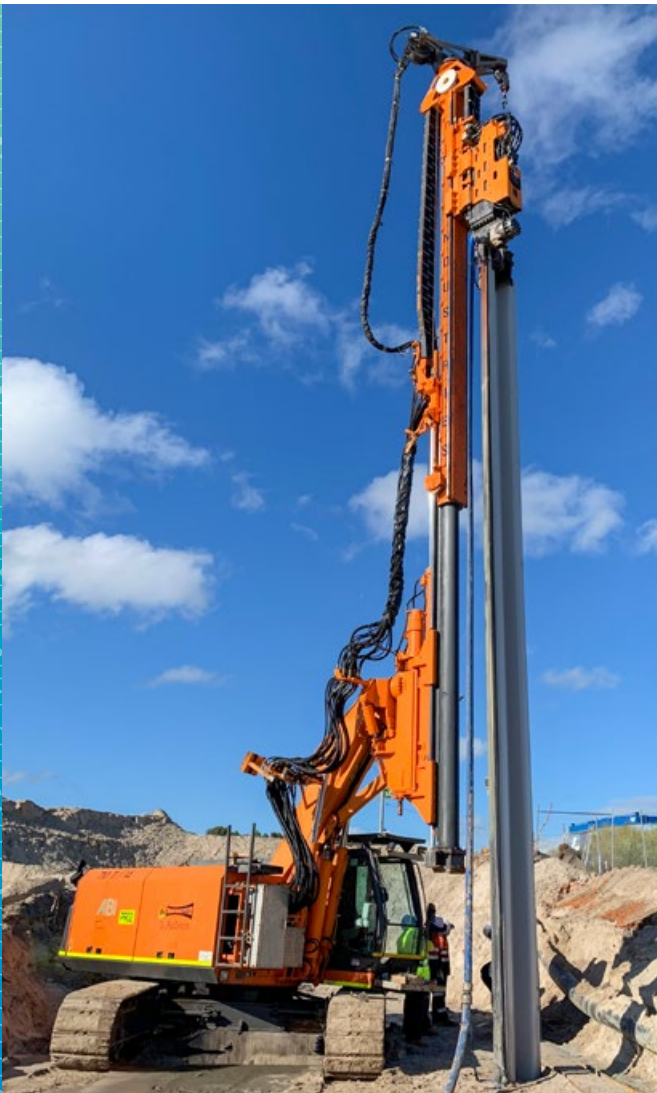
Image: Sheet piling Bandy Creek Weir reconstruction

Assuming your other contractual obligations are met, you can now submit your first payment claim.