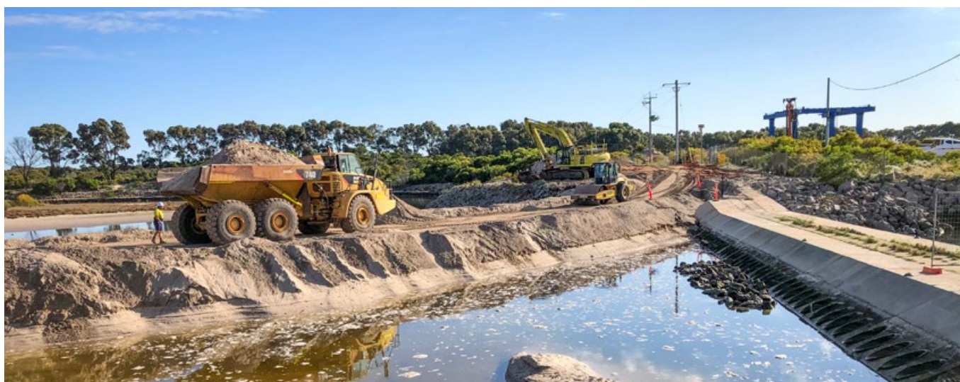
Image: Excavation works at Bandy Creek Weir reconstruction

Detailed instructions for how to complete the Payment Report are included on the following pages.