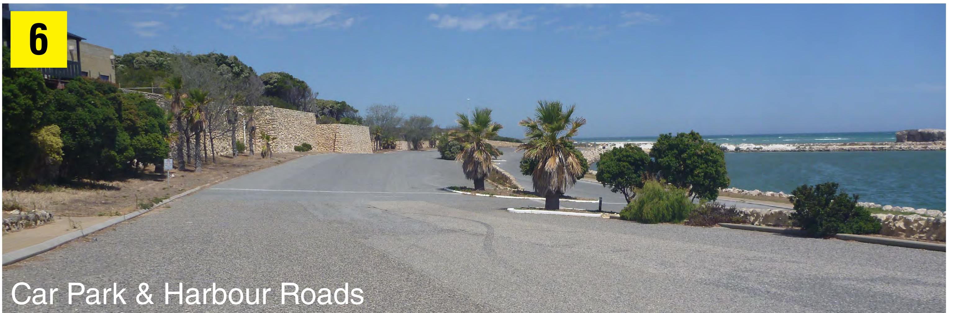
Car Park & Harbour Roads