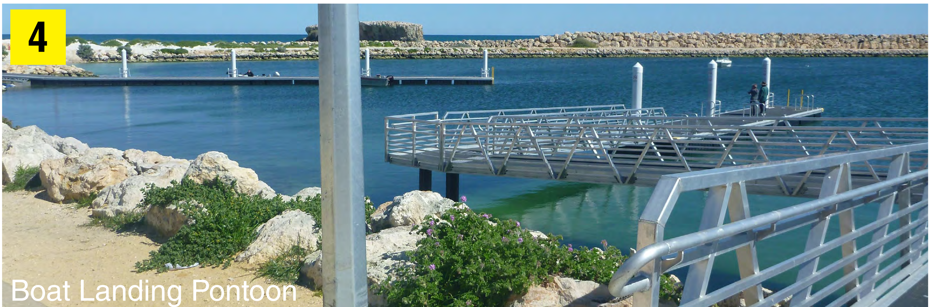
Boat Landing Pontoon