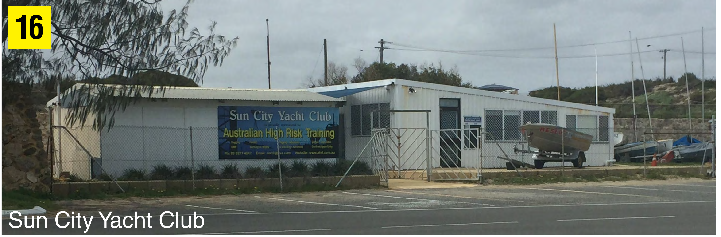
Sun City Yacht Club