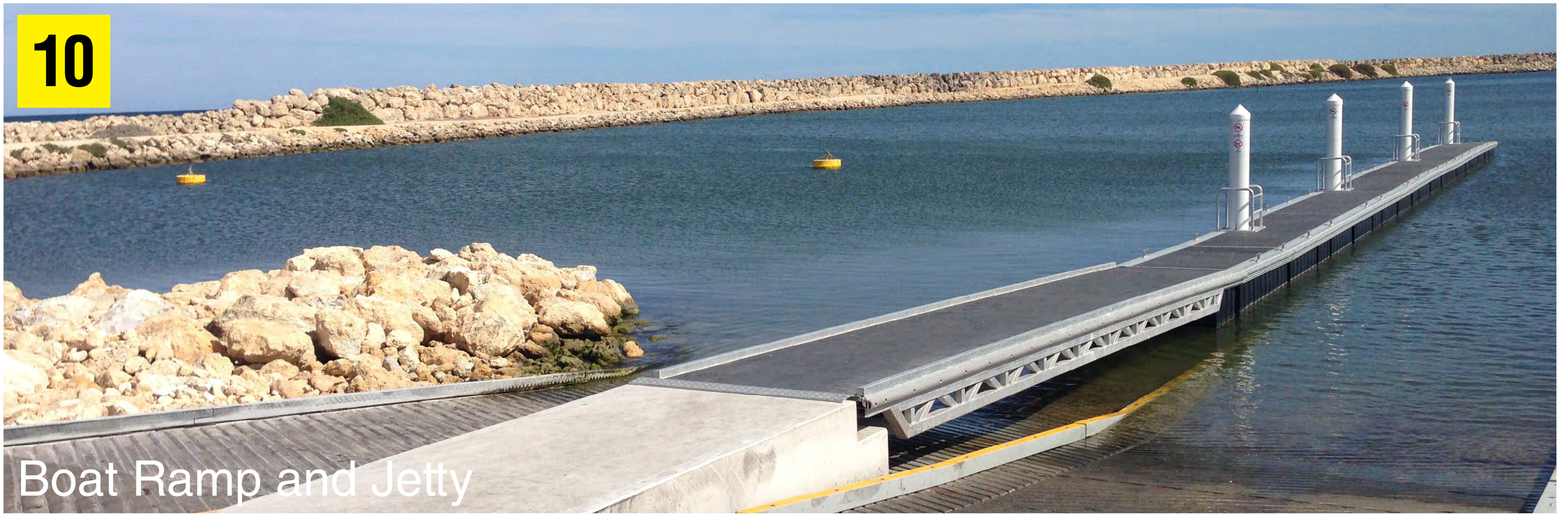
Boat Ramp and Jetty