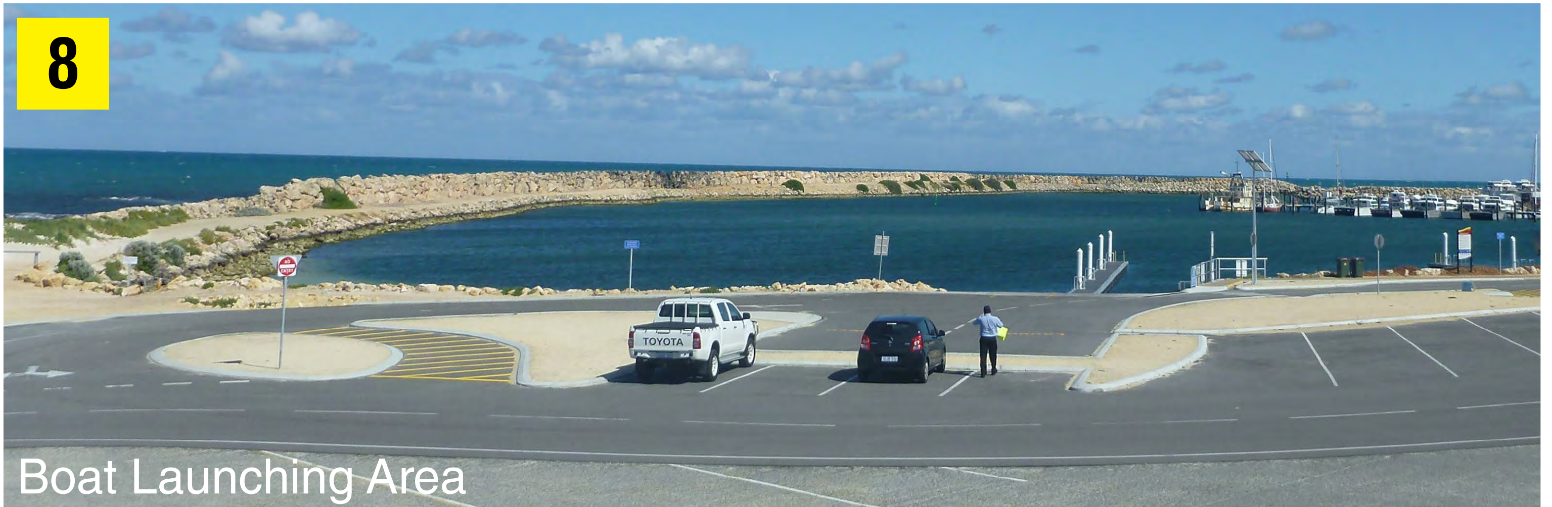
Boat Launching Area