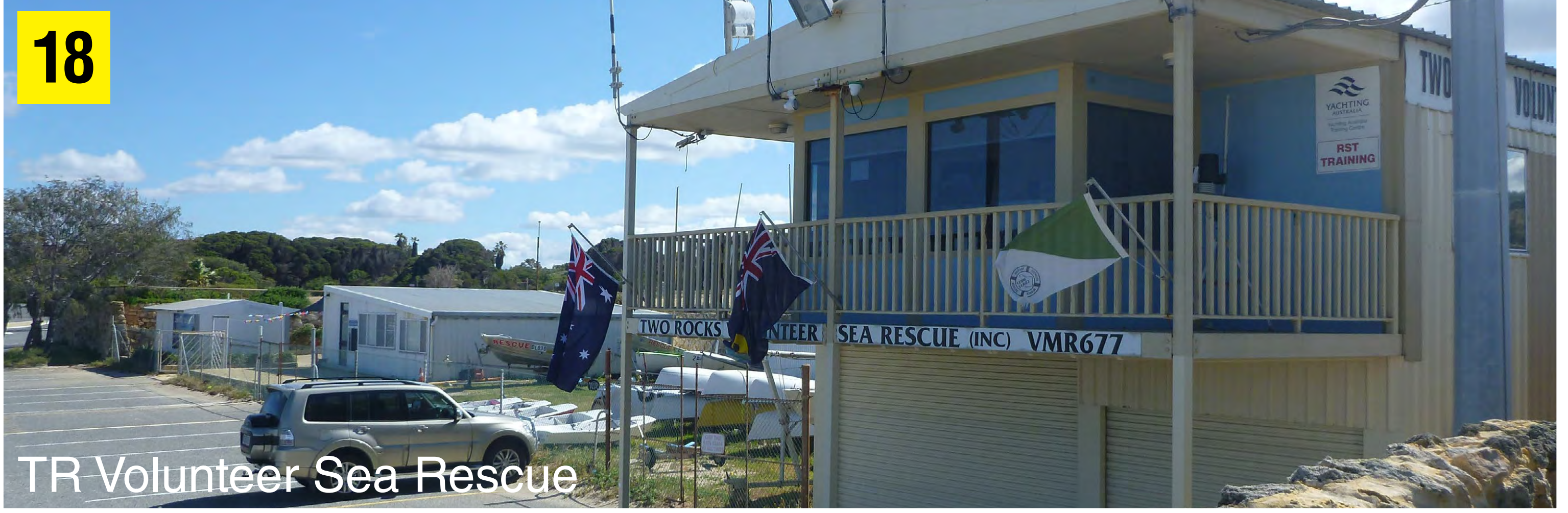
TR Volunteer Sea Rescue