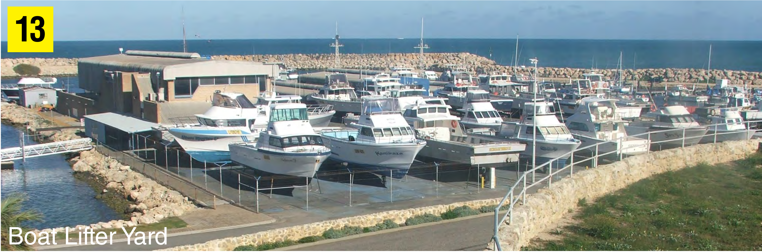
Boat Lifter Yard