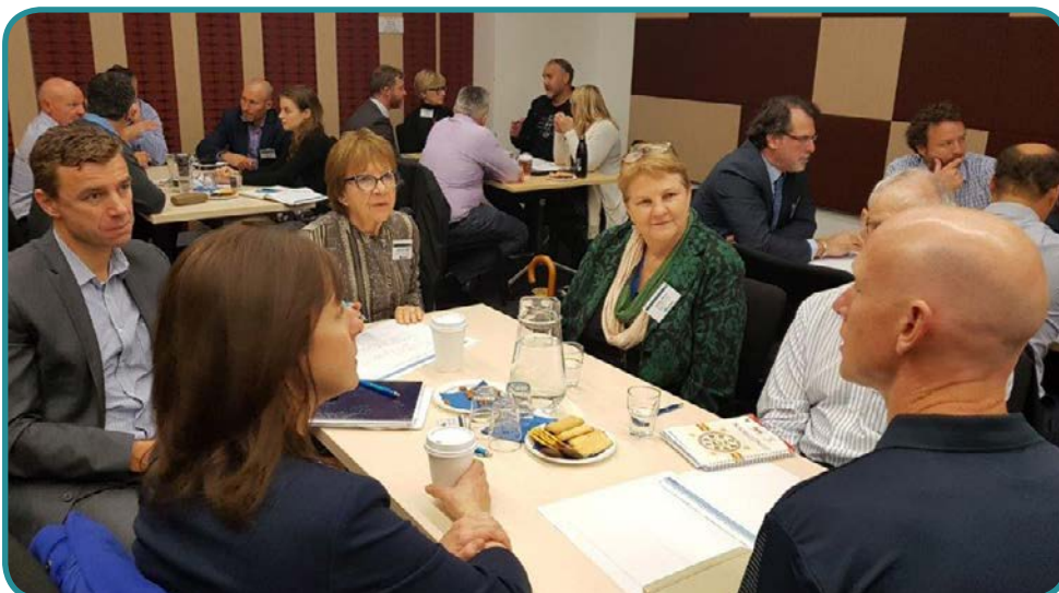
Representatives at the fourth Reference Group workshop.

The next Reference Group meeting is planned for October 2018.